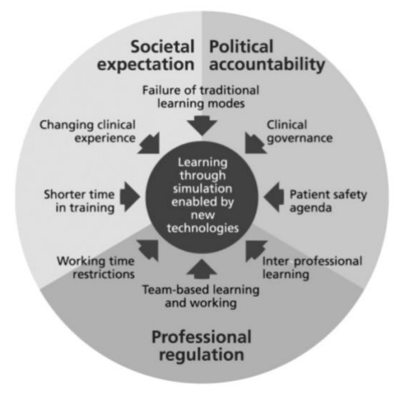
Figure 1. Drivers for the development of simulation

One of the current trends in medical education is utilization of simulation techniques which is becoming an essential component of most medical programs (Ker & Bradley, 2010; see Figure 1). Among factors contributing to the proliferation of simulation techniques are listed such as shortening training time, conducting training at a suitable time, team-based learning and assuring patients' safety (see Figure 1).