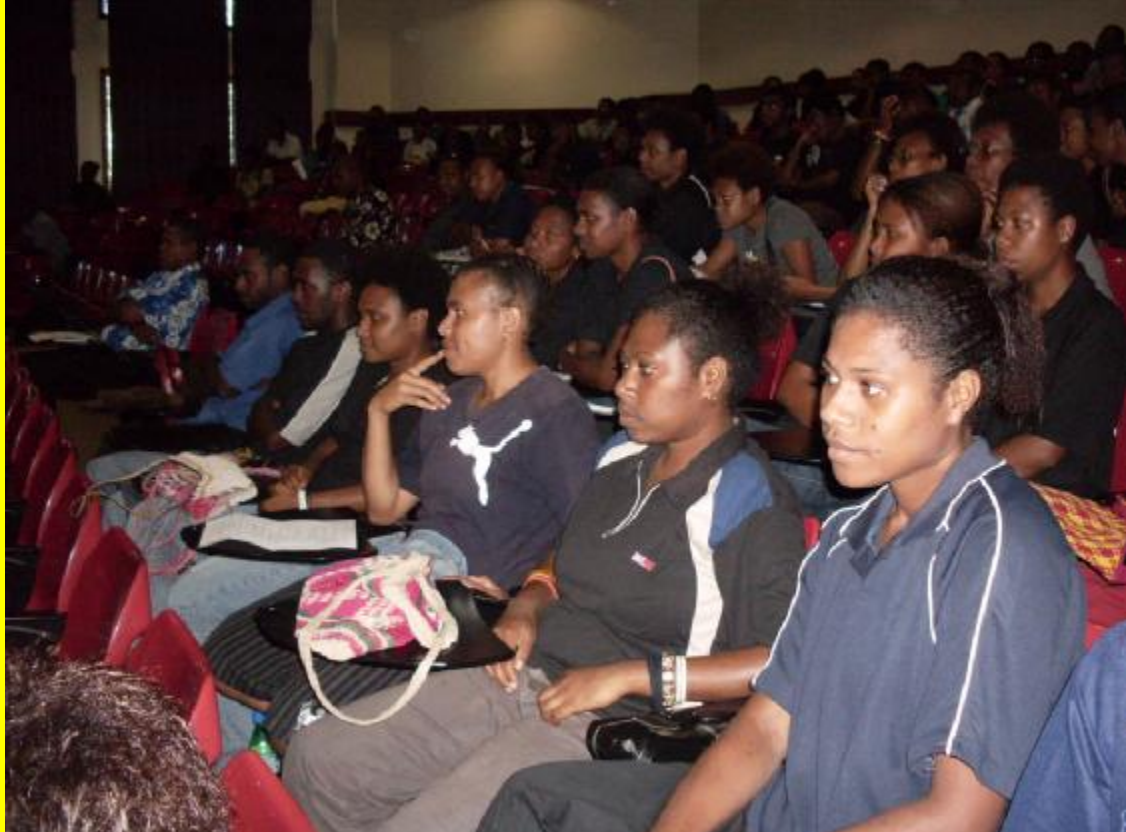
Top: An attentive audience enjoying the show Below: Students wearing the 2009, Media Freedom Day printed shirts