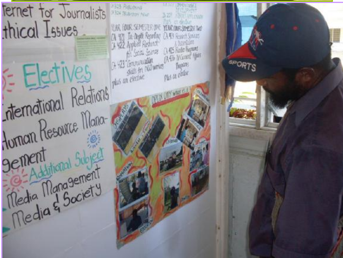
Top: Explaining how layout and design is done Below: Photography display