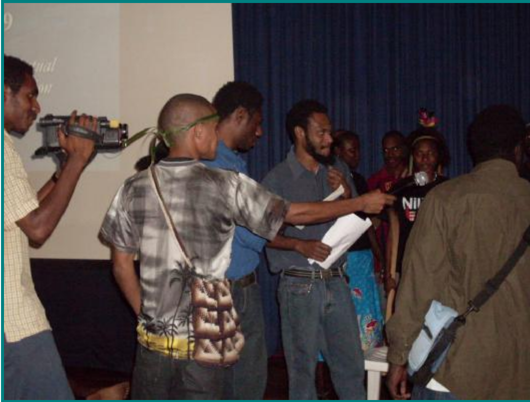
PNG Studies Year One students performing a drama on a village community exposing illegal logging in the media