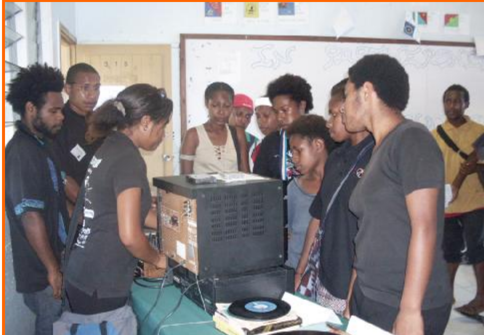
Top: Showing how it used to be Below: Television with a mock-studio with live interviews