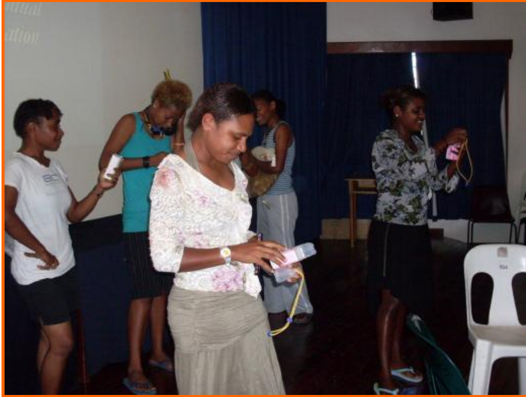
Communication Arts Year One students showing off the new 'diwaicel', the latest in technology in the communication and fashion era...in a drama of course!