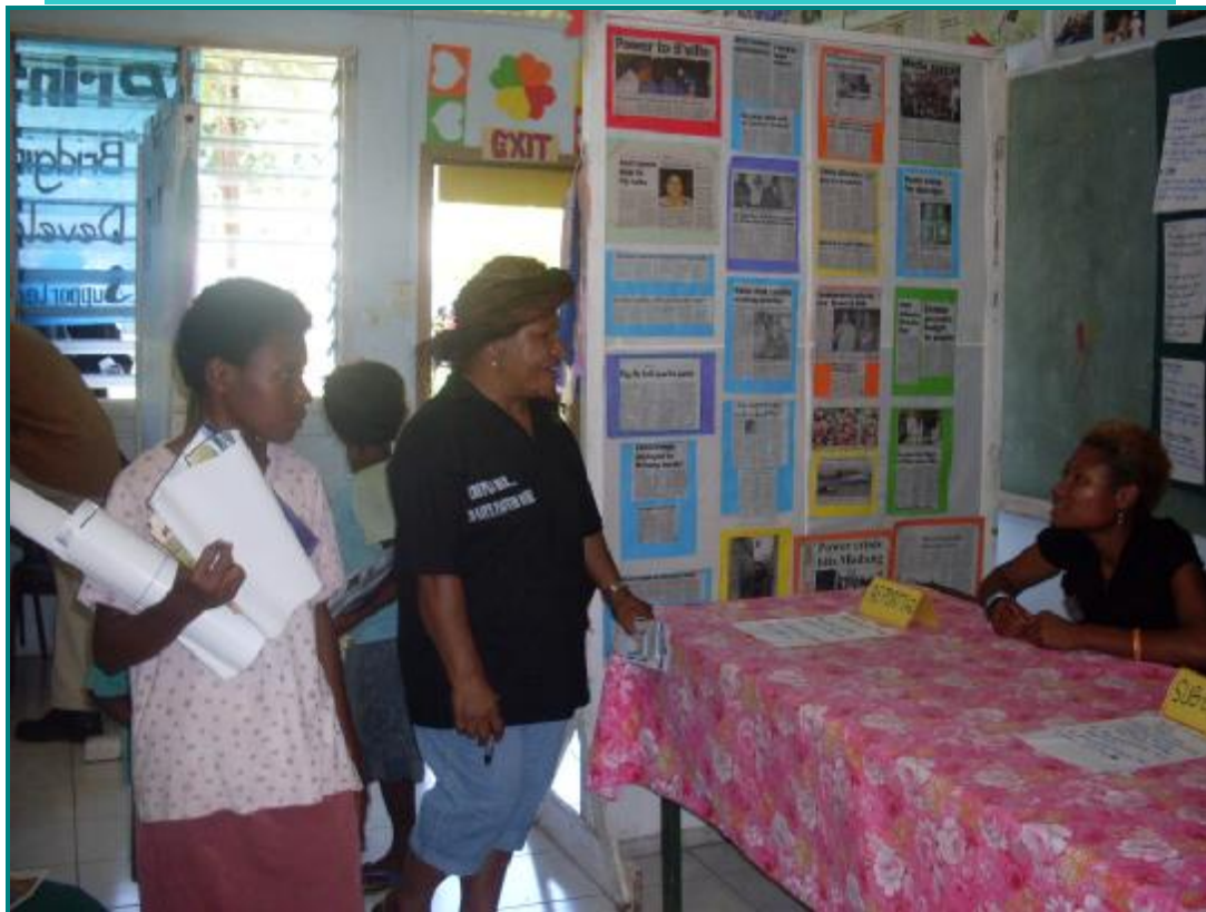
Explaining the role of the reporter, sub-editor and chief of staff in the print medium