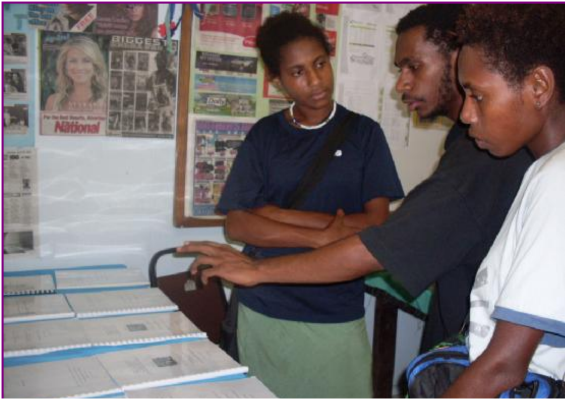
Top: Display of student dissertations