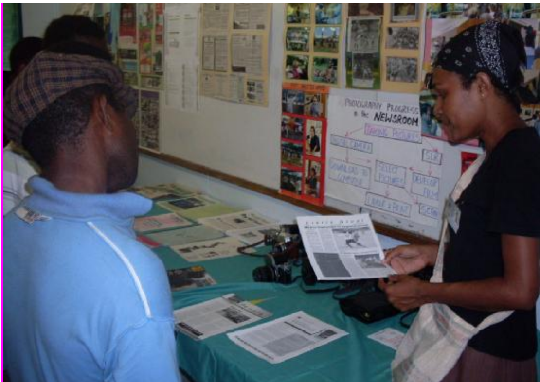
Below: Student holding Liklik Diwai, which is now e-Diwai