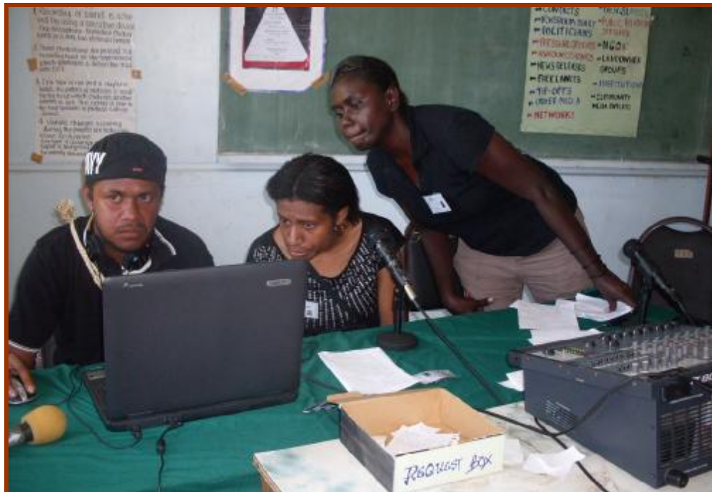
Top: Radio Diwai on air with journalists preparing to read the news Below: Displaying audio recording equipment

World Media Freedom Day on May 3 rd coincided with Divine Word University's annual Open Day. This allowed journalism students to show the public what they studied at DWU and create awareness of need for media freedom.