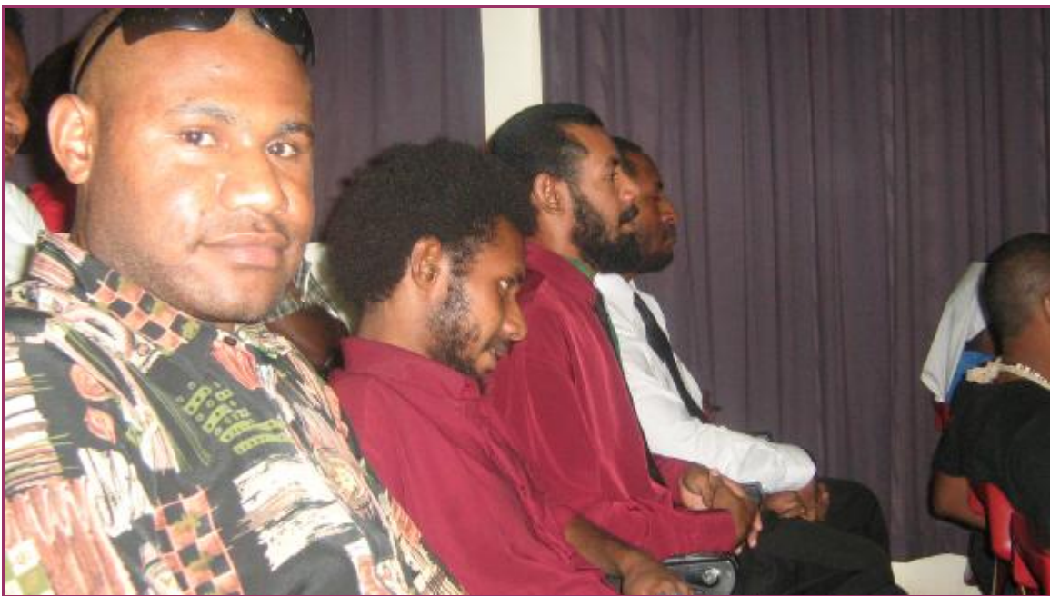
Young men from PNG Studies Department who attended the celebration.