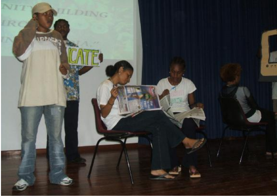
Communication Arts Yr, 1 students perform a drama depicting different media available in PNG