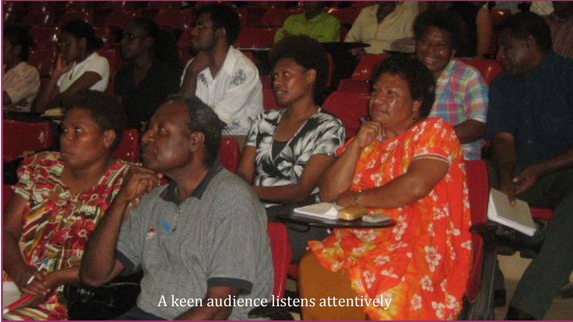
A keen audience listens attentively