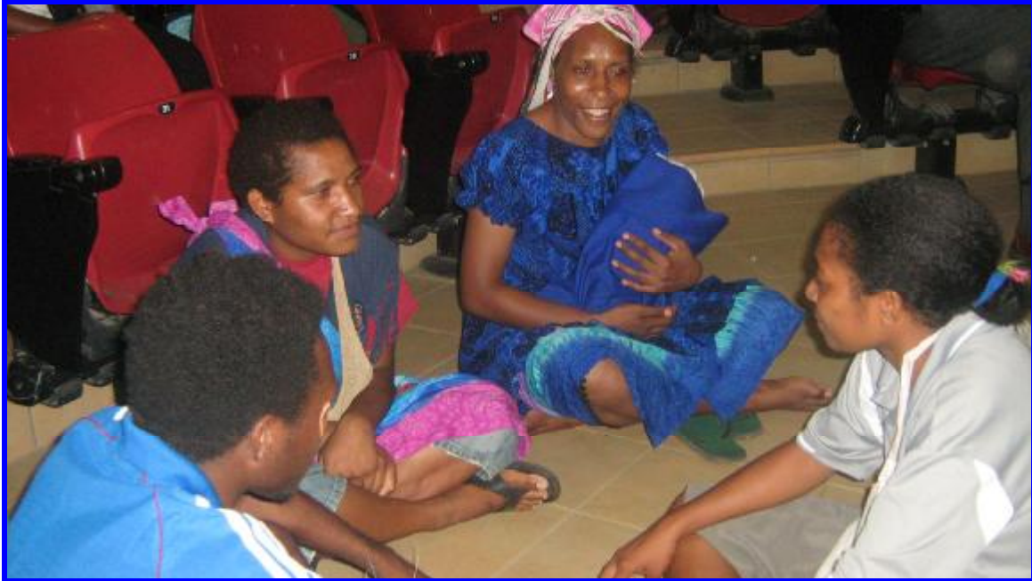
Students from the Religious & Social Studies Department also joined in the celebrations with a drama depicting media in rural development. Above and below