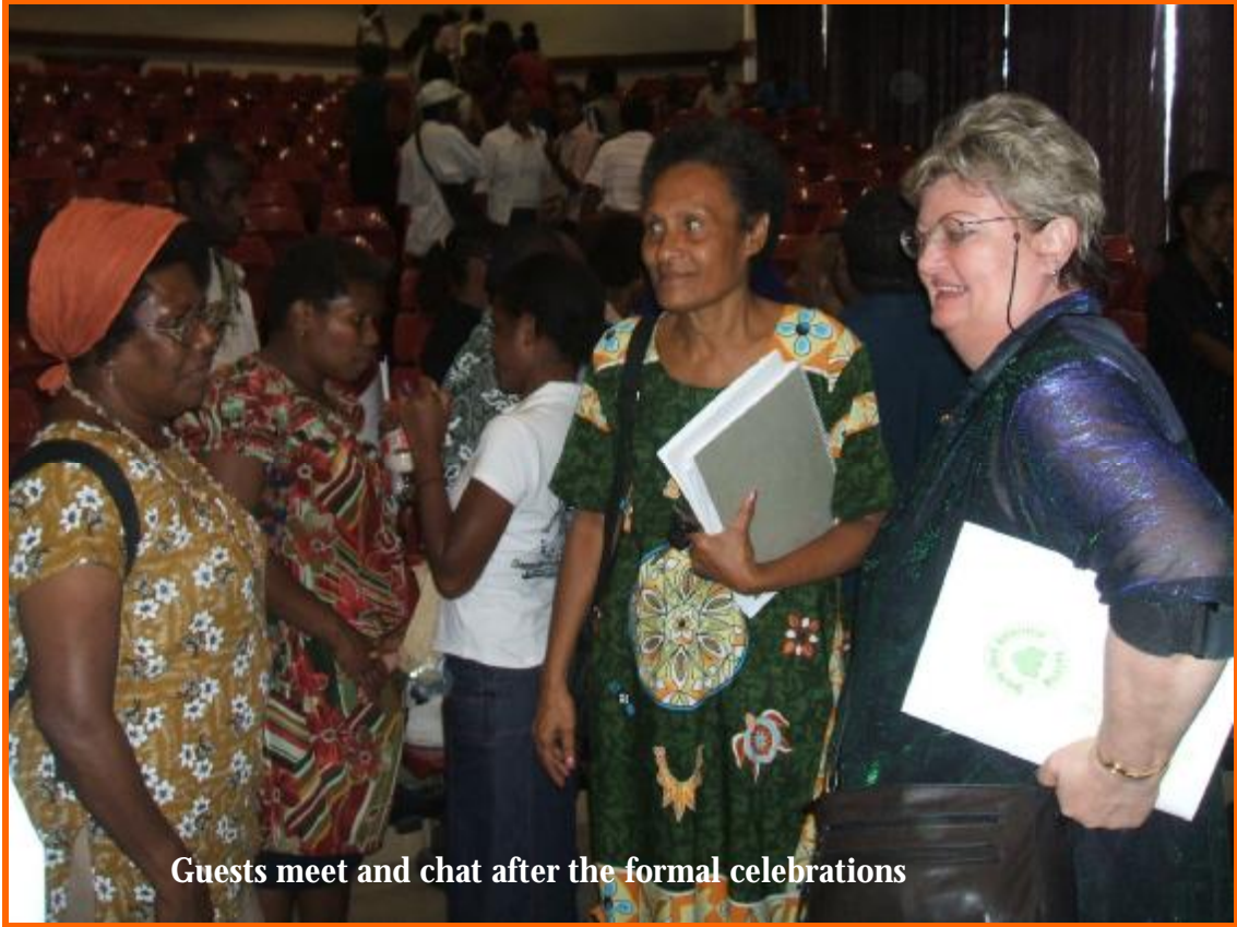
Guests meet and chat after the formal celebrations