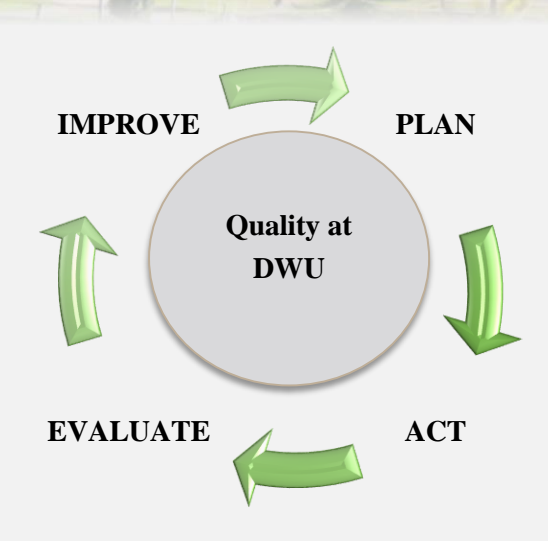
Figure 1: DWU Continuous Quality Improvement Cycle

Plan: The stage at which DWU states through its formal plans at all levels what we aim to achieve and how we will do this, including university level strategic planning and planning by organisational divisions. It is also the level at which policies and regulations are developed to ensure coordination and consistency in how we implement plans.