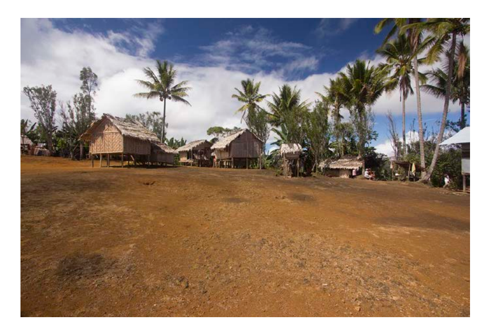
Plate 2. Living conditions at Loni hamlet, part of Manari village at 1110m altitude, Ward 18 of the Koiari Rural LLG area, Central Province, 8 Aug 2014. Note: No safe water supply, no improved sanitation, no houses connected to power, no insect vector-proof houses, access by foot only.

This is a major finding because the gap is not subject to any systematic bias due to the method of calculation.